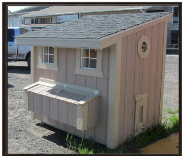
4'x6' Chicken Coop

Basic style, most economical for storage