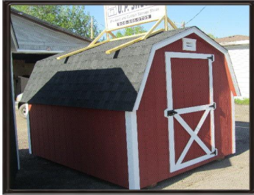
Mini Barn Style